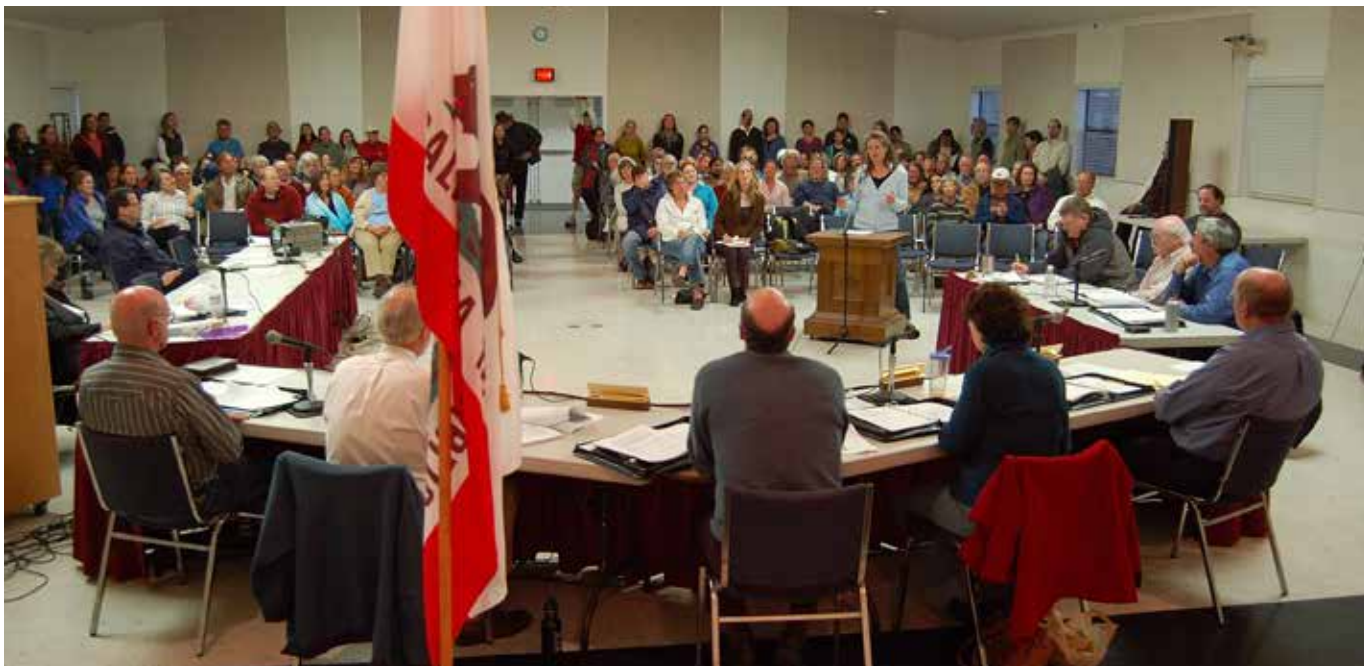
Image: Global Exchange and CELDF supporting community team at a city council meeting

From creating a calendar for an ordinance, to writing the ordinance to training volunteers to creating a media campaign to signature gathering and everything you'll need to know in between, Global Exchange works with communities every step of the way. We are with communities every step of the way in the process with no charges for service. As your primary partners we will guide your community through the process from beginning to victory, assisting with steps, outreach, signature-gathering and more. We partner with CELDF (Community Environmental Legal Defense Fund) who provide legal assistance and answer any questions specific to legal processes to provide communities with a full spectrum of support and services. We are here to answer any questions you have and are ready to help you assert your rights in your community when you are!